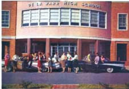
Students gather outside De La Warr High School in 1965.