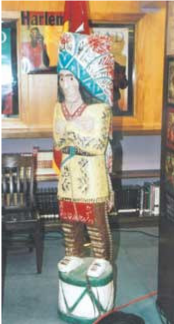
A statue of the Conrad Indian, representing the school's mascot, was displayed at a 2005 press conference announcing the re-opening of the school.

Henry C. Conrad High School will return by the 2007-08 school year, mixing a focus on biotechnology and allied health career programs with a traditional program