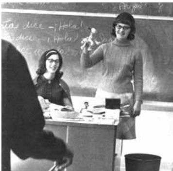
Students in the Gunning Bedford High School Future Teachers of America give a presentation during the 1964-65 school year.