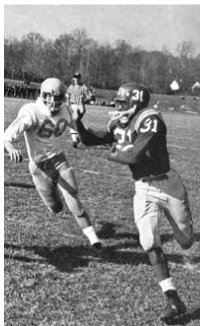
A Conrad High School football player, right, wearing the school colors of grey and scarlet, tries to elude a defender during the 1966 season.