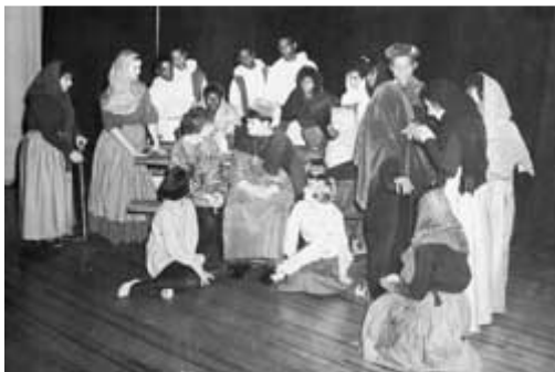
Students from the Drama Club perform the Nativity scene in 1963.