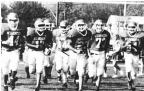
The 1996 Wilmington High School football team takes the field.